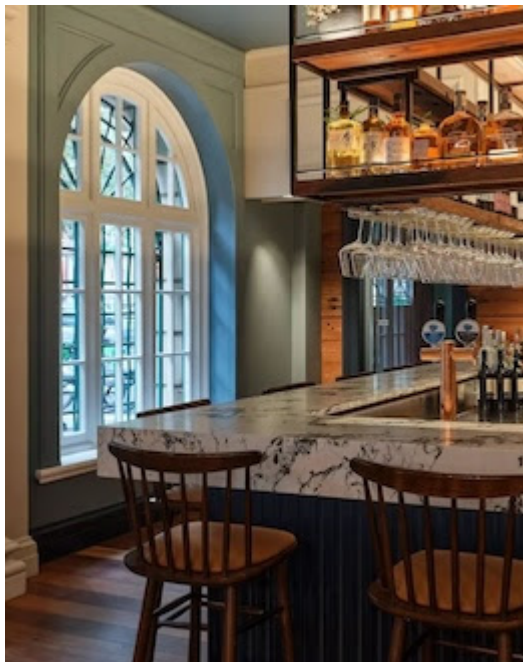
Get Free Dessert Or Cocktails At This Sydney Venue Until Saturday