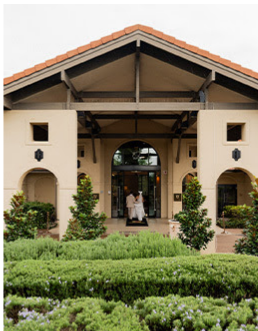
Your Chance To Score A Hunter Valley Wedding Valued At Over $7.4K