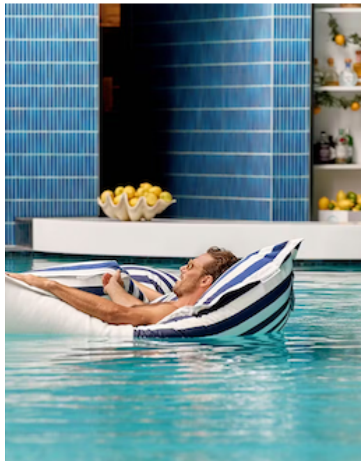
Here's How To Spend A Luxe Weekend In Brisbane, According To Our Editor